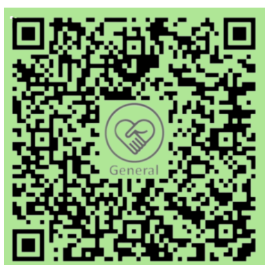
General Fund S76SS0008AGFD

Last Sunday's Giving (GF): $12,611 / $13,500