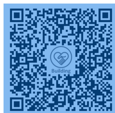
Building Fund S76SS0008ABFD