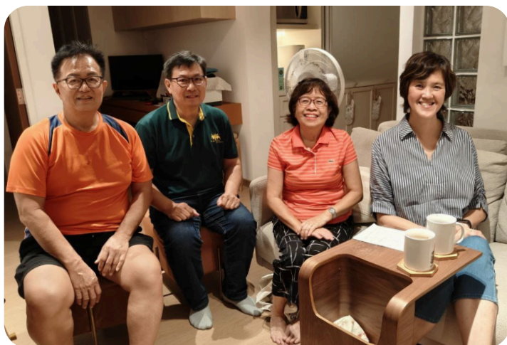
The team at a pre-trip planning session.