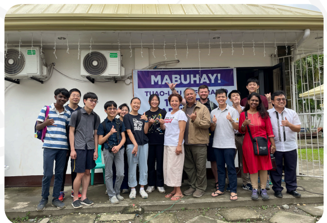
The team poses with the Mayor of Tuao and his wife. God opened many doors on this trip to interact with people in positions of influence!

What did we do to deserve any of this? We were not professionals - we were just a group of young people offering what we had to bless the people around us. But that night, God multiplied what we had beyond our wildest imaginations.