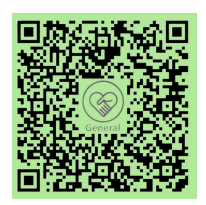
General Fund S76SS0008AGFD