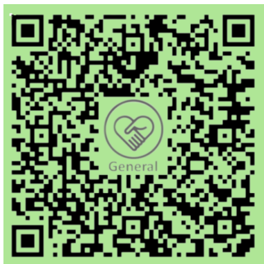
General Fund S76SS0008AGFD