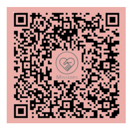
Missions Fund S76SS0008AMFD