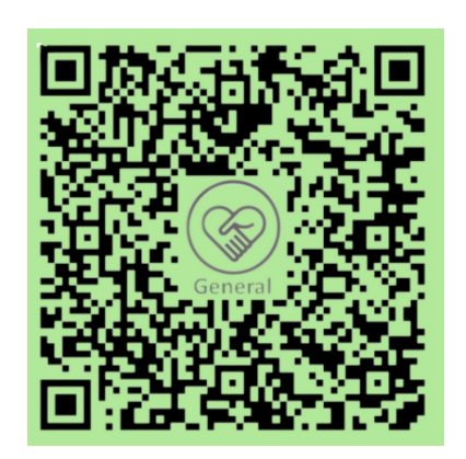
General Fund S76SS0008AGFD