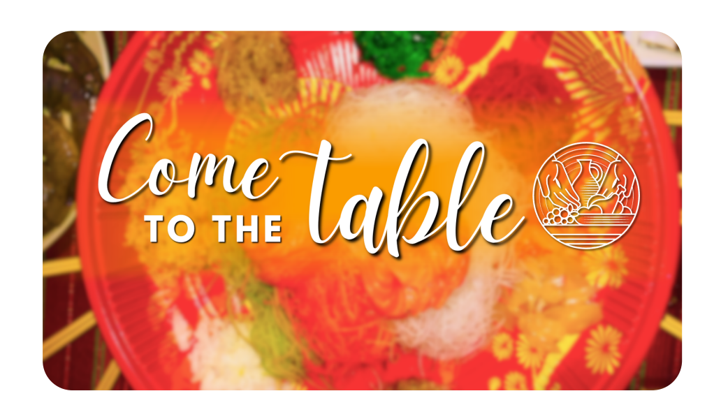
From the Table to the Field | 16 June 2024