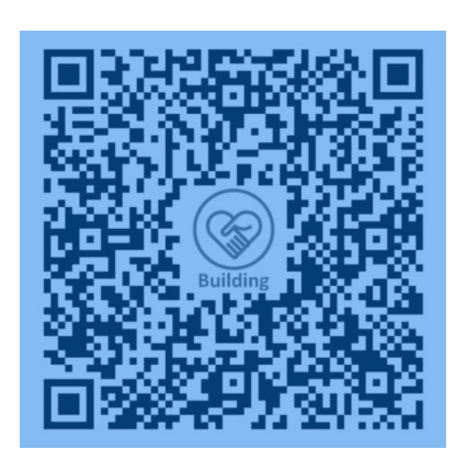
Building Fund S76SS0008ABFD