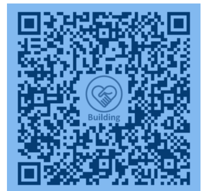
Building Fund S76SS0008ABFD