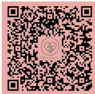
Missions Fund S76SS0008AMFD