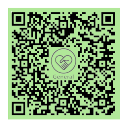
General Fund S76SS0008AGFD