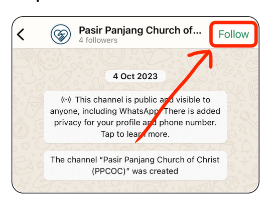
Step B: Click "Follow"