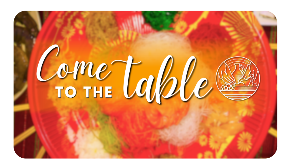
A Tabled Resolution | 26 May 2024

We live in a relatively peaceful society, and we thank God for that. We live in a country that prides itself on being a multicultural and multi-religious society where differences are embraced and celebrated. And in the name of keeping the peace, we like to avoid conflict wherever we can help it. We like to "save face" and hope that any tensions will fade away with time.