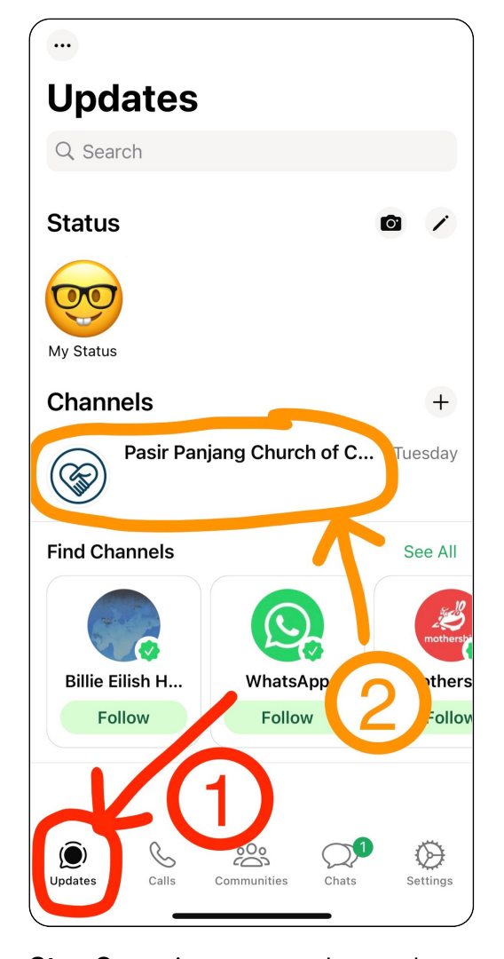
Step C: To view past updates, please select (1) "Updates", then