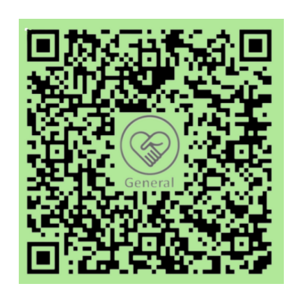
General Fund S76SS0008AGFD