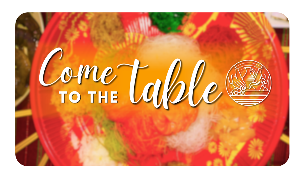
Who's At The Table? | 19 May 2024

"Why is THAT PERSON here?!" It's a thought that flashes through the minds of students when the unpopular kid sits within five seats of their "in" group. Or when the unwashed, unkempt homeless person walks into a fancy restaurant. For the people already there, there is revulsion. "They're not one of us. They don't belong in this space."