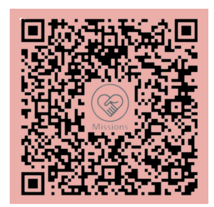
Missions Fund S76SS0008AMFD