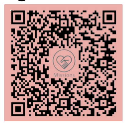
Missions Fund S76SS0008AMFD