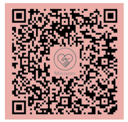
Missions Fund S76SS0008AMFD