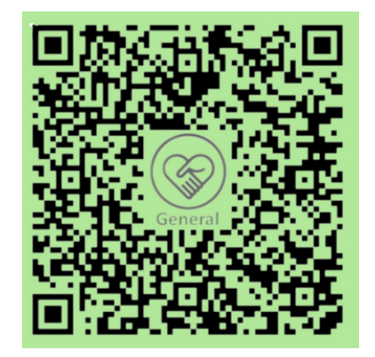
General Fund S76SS0008AGFD