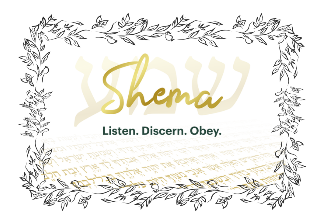
The Soil of Shema | 22 January 2023

Parents with more than one child know firsthand a universal truth: no two people are the same. One gobbles up their broccoli without being asked, another avoids it like the plague. One barely needs to be told to clean their room, while another needs direct supervision and frequent reminding.