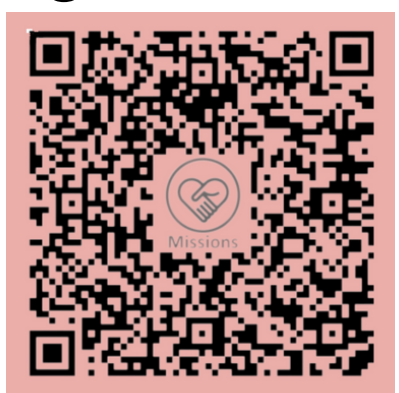
Missions Fund S76SS0008AMFD