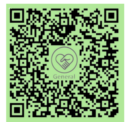
General Fund S76SS0008AGFD