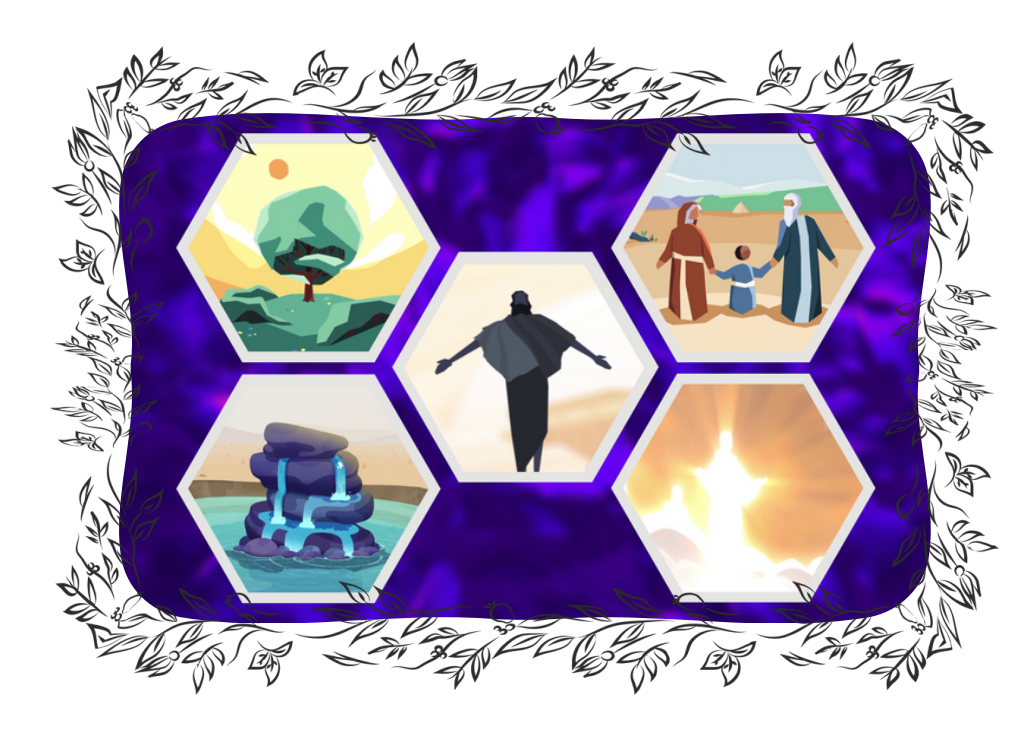
Kyle Hooper | 18 December 2022

Have you ever walked through a public space like a shopping mall or public transport when out of the blue, you hear a child's voice calling "MUMMY" or "DADDY"? Sometimes it's the crying sort when they're lost, sometimes it's out of sheer delight at seeing their parent. It doesn't even matter that hundreds of onlookers are staring at them; they only have eyes for their parent.