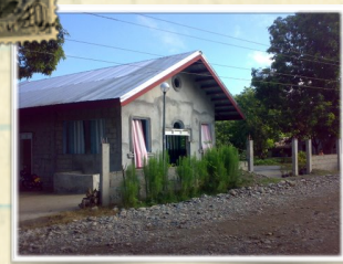
The new building in 2007

The new building today, the interior renovation funded by the Tuao members