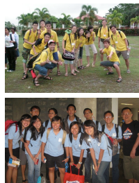
Youth Mission Teams and Interns