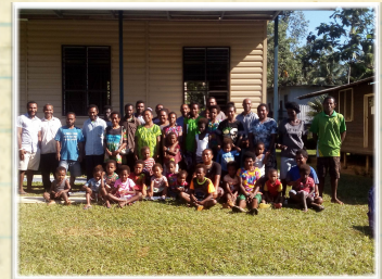
Papua New Guinea