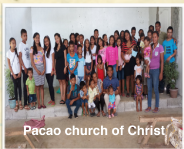
Pacao church of Christ