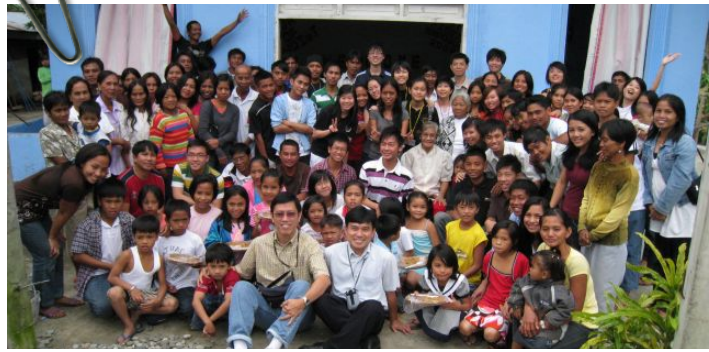
The Tuao church members and the 2008 Youth Mission Team

Your prayers for the Tuao church and their work will be much appreciated.