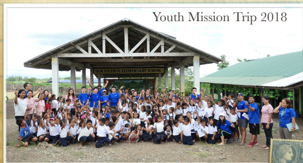
Youth Mission Trip 2018