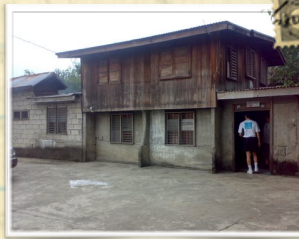
First meeting place