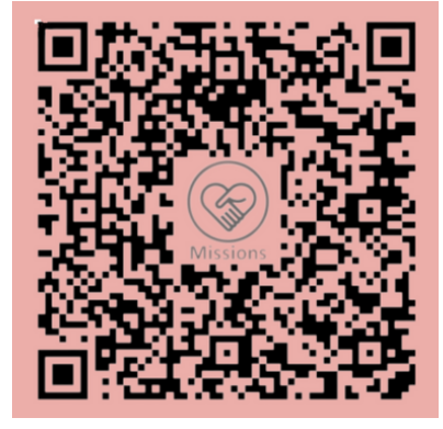
Missions Fund S76SS0008AMFD