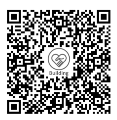
Building Fund S76SS0008ABFD

If you plan to make a contribution via cheque, please make sure it is payable to "Church of Christ, Pasir Panjang, Singapore". Please ensure that you write the full name so that the cheque can be processed <sup>02</sup> smoothly.