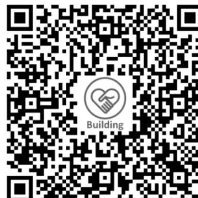
Building Fund S76SS0008ABFD

If you plan to make a contribution via cheque, please make sure it is payable to " Church of Christ, Pasir Panjang, Singapore ". Please ensure that you write the full name so that the cheque can be processed smoothly.