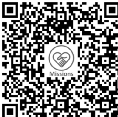
Missions Fund S76SS0008AMFD