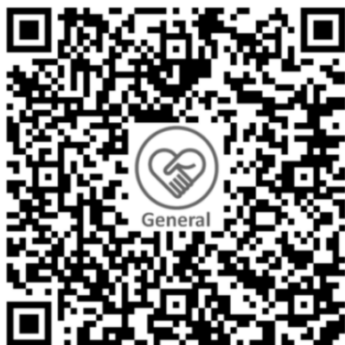
General Fund S76SS0008AGFD