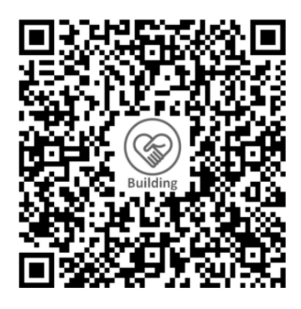
Building Fund S76SS0008ABFD