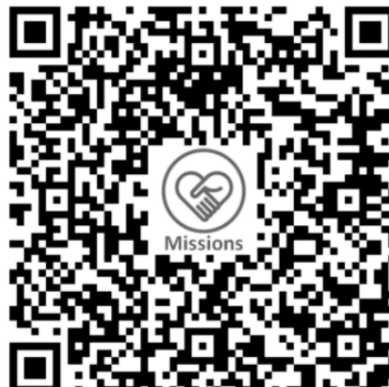
Missions Fund S76SS0008AMFD