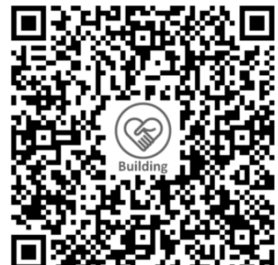
Building Fund S76SS0008ABFD