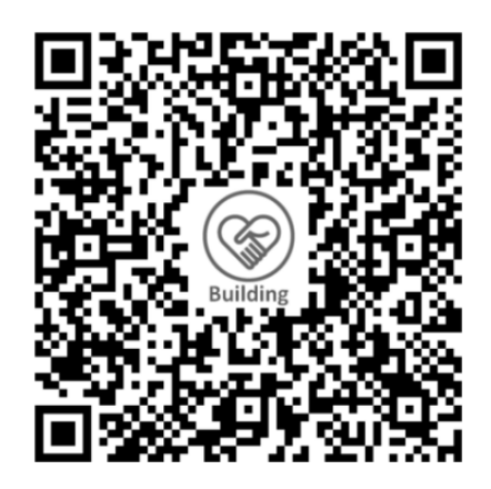
Building Fund S76SS0008ABFD