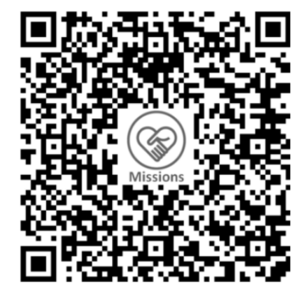
Missions Fund S76SS0008AMFD