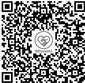
Missions Fund UEN: S76SS0008AMFD

We're excited about these opportunities to invest in the next generation as they prepare for a more loving life by receiving much needed care and counselling.