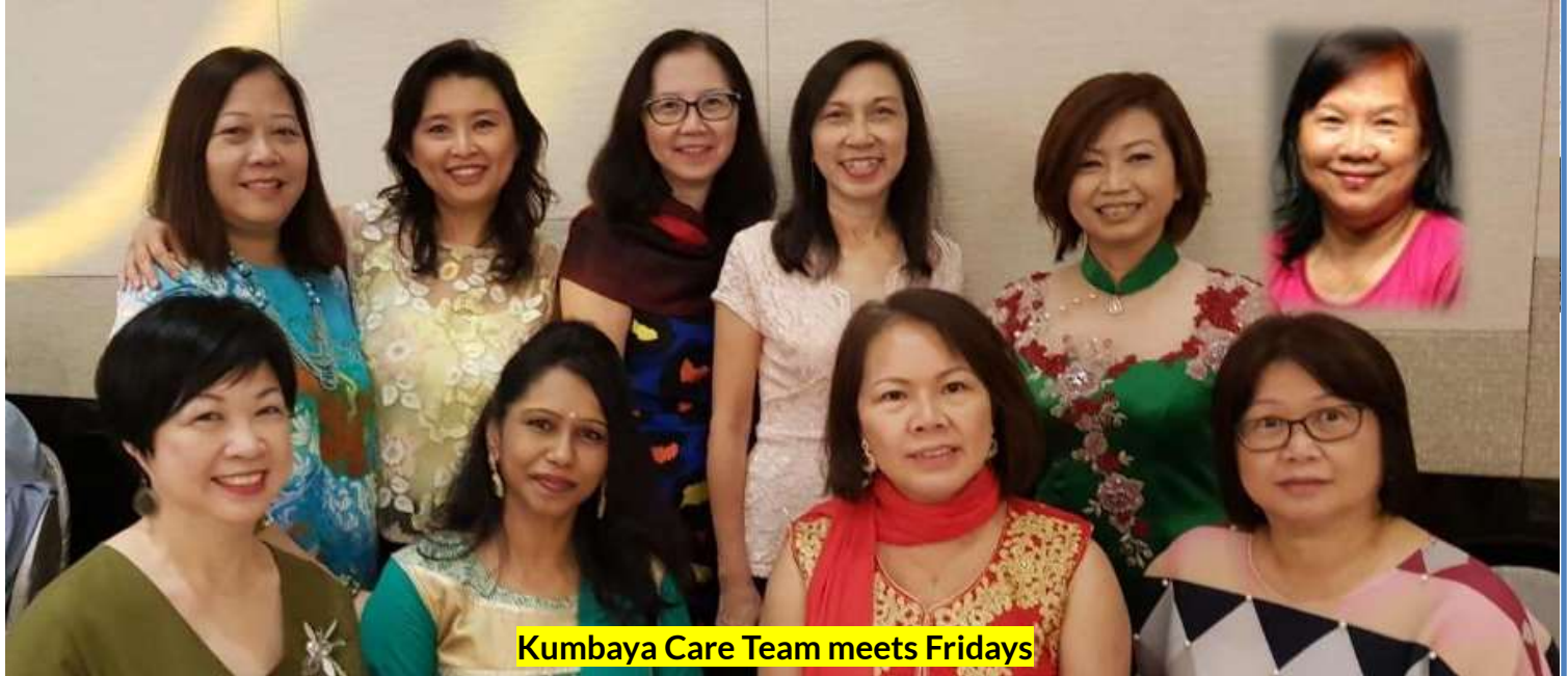
Kumbaya Care Team meets Fridays