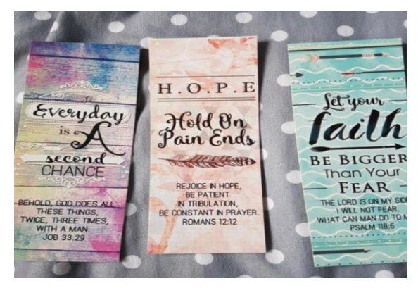
Personalised bookmarks for the Girls' Home.