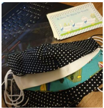
Sending masks and cards to lonely seniors.