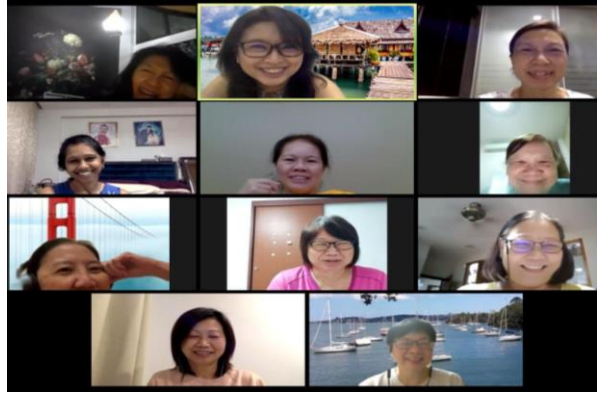
Meeting regularly over zoom to do bible study and pray.