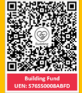
Building Fund UEN: S76SS0008ABFD