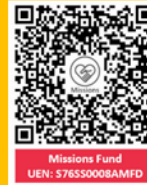
Missions Fund UEN: S76SS0008AMFD