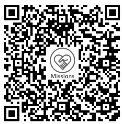
Missions Relief Support UEN: S76SS0008AMFD

The giving for the Mission Relief Support should go to the Mission Fund Account UEN above.