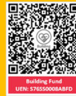
Building Fund UEN: S76SS0008ABFD