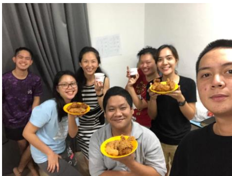
Grab-delivered celebratory dinner for SIBI students

Care teams have continued to meet online and reach out in various ways to encourage the church family and non-members during this Covid-19 period.