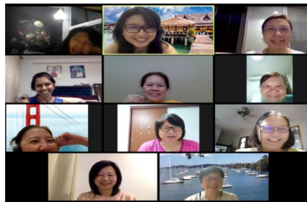
Meeting regularly over zoom to do bible study and pray.