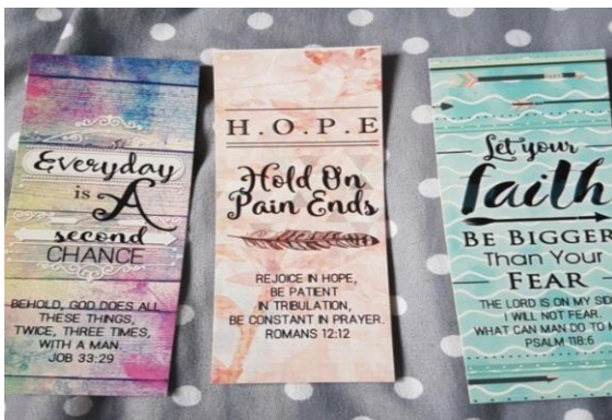
Personalised bookmarks for the Girls' Home.