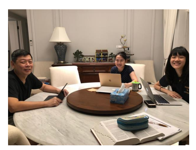
Click the link below for Video on "Breadmaking" during the Circuit-Breaker

Admittedly, staying at home can be boring. But if we try new things, whether it be in the kitchen or at the dining table, it can continue to bring color into our lives even after this health crisis.