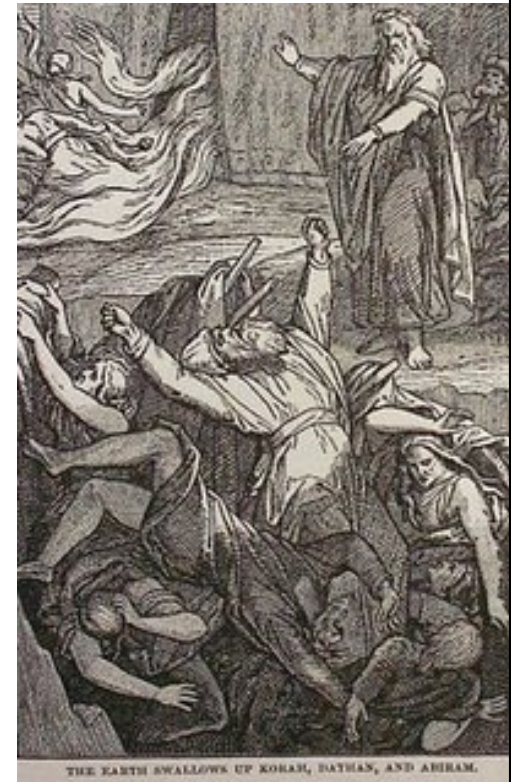
The earth swallows up Korah, Dathan and Abiram