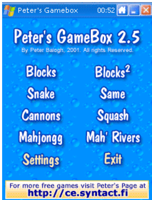
Peter's GameBox 2.5

Congratulations if you have purchased a PPC. If all you have been doing with it is a little more than you would with a filofax or organiser, here are some tips to help you get more out of it.