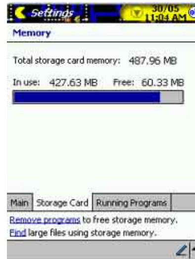
Storage Card Memory .... wow!

The first thing you need to do is to get as large a capacity compact flash as you can afford. These postage-size storage cards are fast and battery-efficient. Next, make it a habit of installing everything on the compact flash by answering 'No' to installing program into the default installation folder. Leave as much RAM to the CPU, not storage. Even Avantgo can be installed to storage card with a little hack at the registry. Take a look above and see the enormous free RAM (over 25mb) for an almost full-512mb CF running on a 32mb iPAQ.