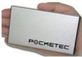
40GB Portable Hard Drive $394.95