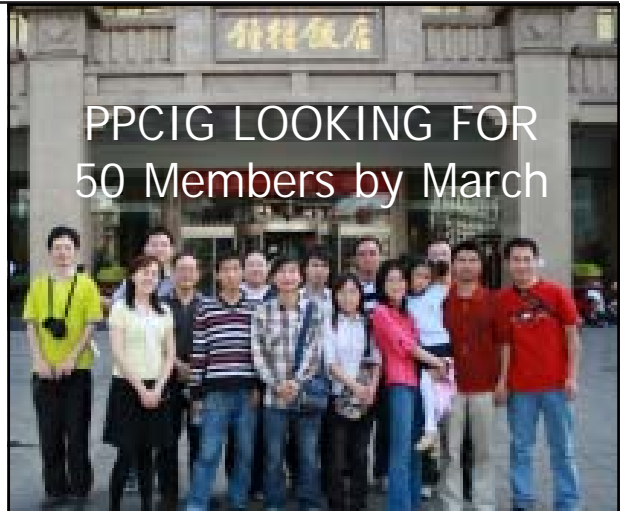
PPCIG LOOKING FOR 50 Members by March

PPCIG (PP China Interest Group) is pursuing an all-inclusive policy so that anyone who wants to be in the PPCIG will not be turned away. Everyone can be involved at any of these 7 levels as they feel comfortable: