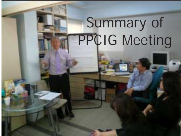
Summary of PPCIG Meeting

Although the PPCIG mode of operation has functioned largely through emails, it was important that a general meeting be convened since a number of important changes are taking place: