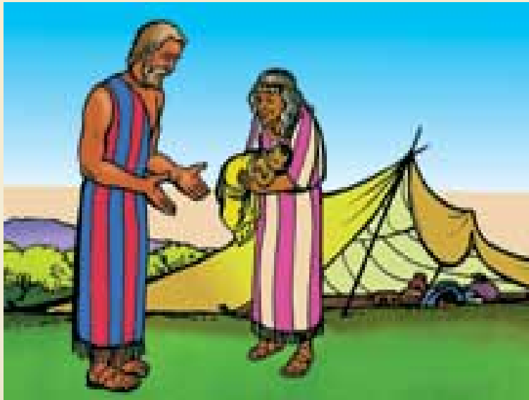
100 years old, Genesis 21:5