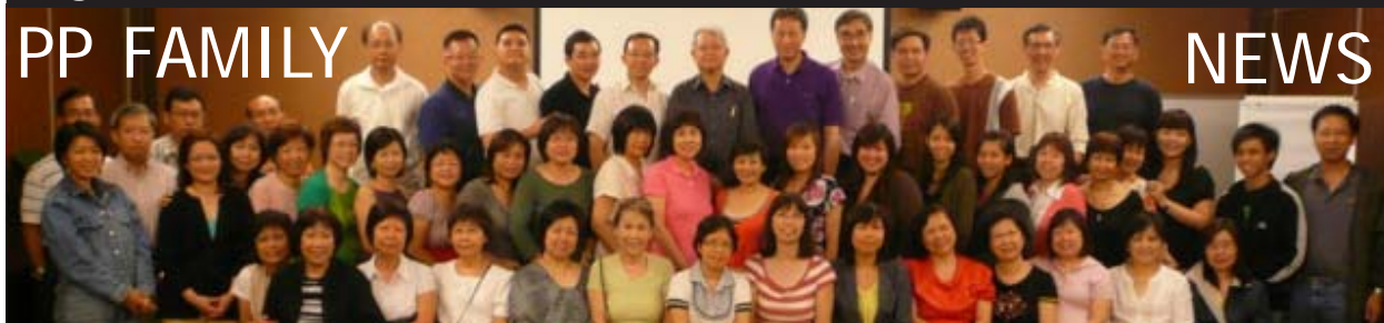
Above: Group photograph of the Care Team Coordinator's Sycamore seminar on 30th May 2009 at NUSS.

We want to extend a warm welcome to all our guests at PP, especially to over 2 dozen overseas Christians who are here to attend the annual church camp.